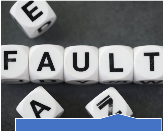
The Blame Game!