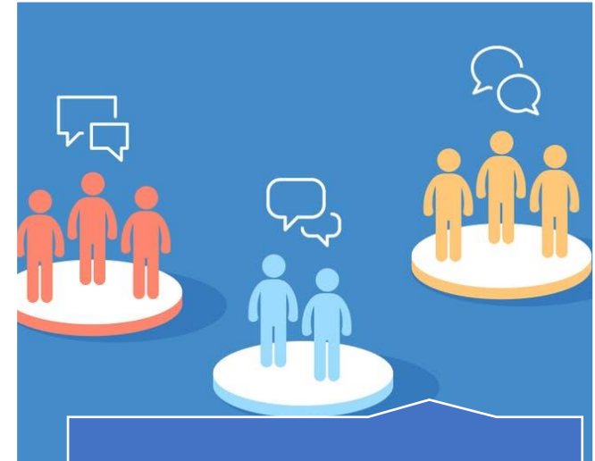
Working in Silos