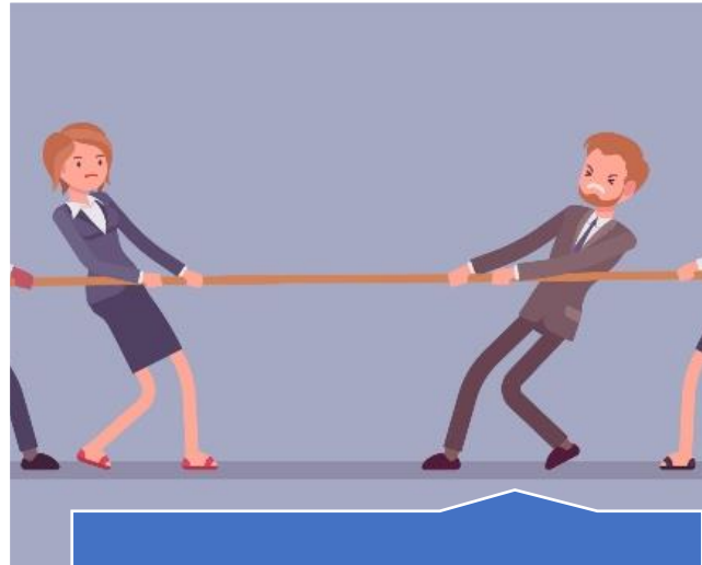
THEM vs US