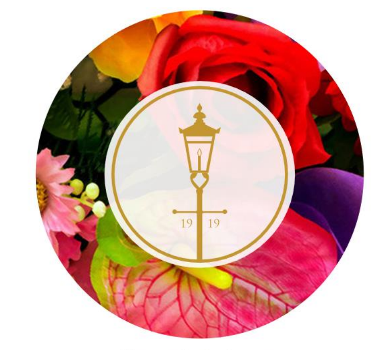
You are invited to our